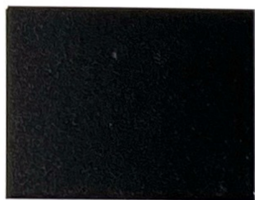
Bayside Ultra Black